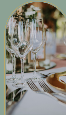
DINNER & GLASSWARE